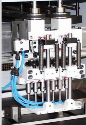
Optional 3-way drilling head with cooling and spraying device